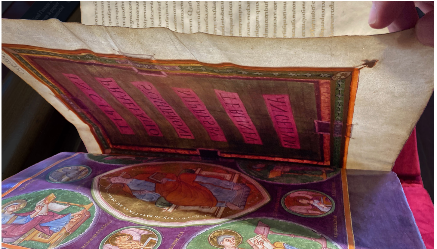
Évangélaire de la Sainte-Chapelle, BnF, Latin 8851, fol. 1v-2r, 3r.